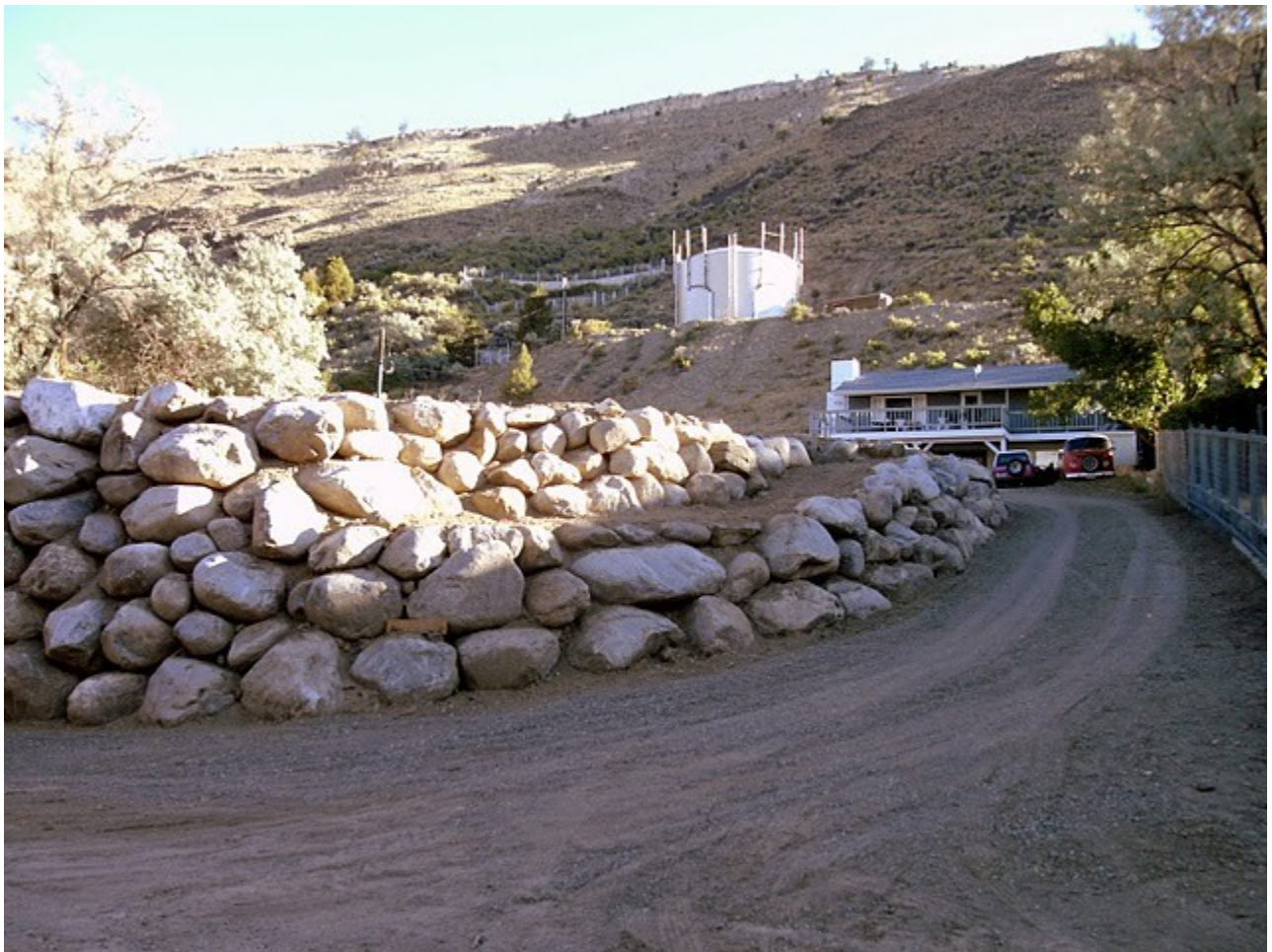
This is our driveway in the photo above 128 Granite

At the end of Hellroaring turn right and proceed till you see a large granite wall, turn left up our drive.